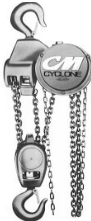
8 ton capacity