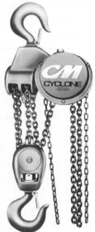
10 ton capacity