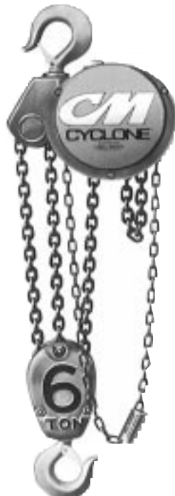
5 and 6 ton capacity