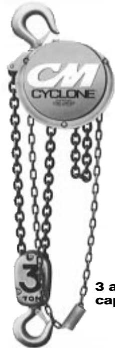
3 and 4 ton capacity